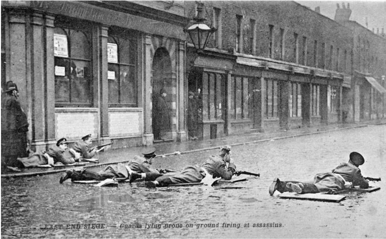
EAST END SIEGE. — Guards lying prone on ground firing at assassins.